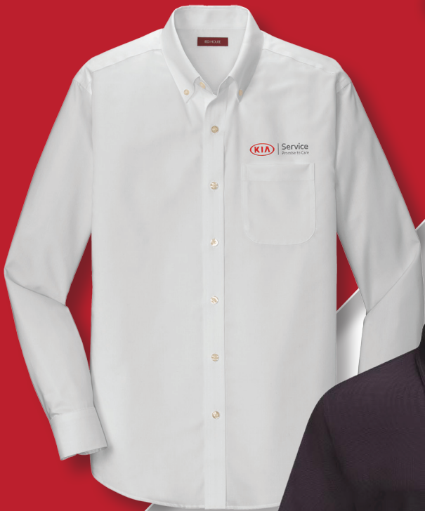
Image Apparel Program